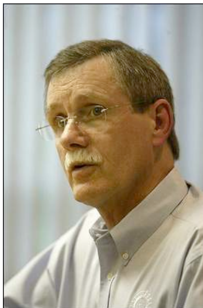
Gettelfinger ▶ See full image

More Online ▶ Talk about it in Autos Talk