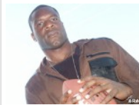
Athletes Naturally Build Strength, Endurance and Muscle