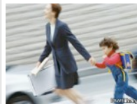
$2 Million in Scholarships for Working Parents Going Back to School

Advertising provided by: ARALifestyle.com