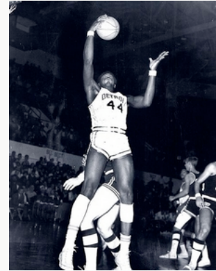
Spencer Haywood only played one season at the University of Detroit, but he is one of the school's best.