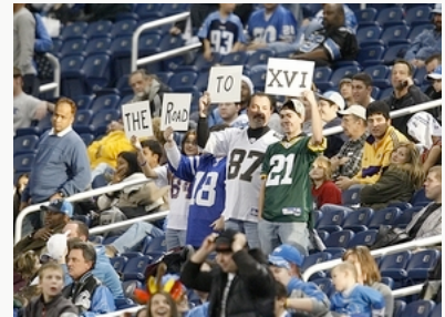
Lions fans aren't selling out Ford Field anymore, but those who are going still are finding something to root for.

Next week, for example, the Lions travel to Indianapolis to face the Colts at brand new Lucas Oil Stadium, where the annual revenue from club and luxury seating is estimated at $25 million. Luxury suites at the Cowboys' palatial new stadium set to