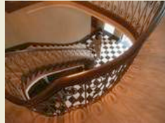
PHOTO GALLERY See inside the Manoojian Ever been curious what's inside? Check out our archival photos taken inside the Manoojian Mansion.