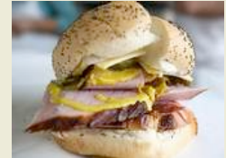
PHOTO GALLERY Metro Detroit's best sandwiches Hungry? You will be after you see a special gallery of the best sandwiches the area has to offer.

COLLEGE FOOTBALL See Big Ten video highlights Watch these video highlights from U-M, MSU and the rest of the Big Ten conference right here on freep.com.