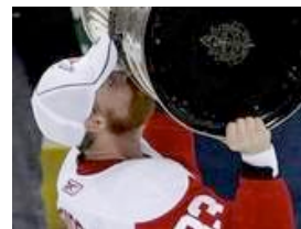
PHOTO GALLERIES Relive the magic of Wings' win Check out our dozens of photo galleries from the Detroit Red Wings Stanley Cup championship season.

PANORAMIC VIEW 360 degrees of Obama rally Check out this freep.com exclusive -- a panoramic view of Sen. Barack Obama's rally at the Joe Louis Arena.