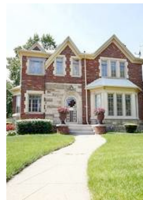
This house in the 18000 block of Warrington is for sale.

Panel discussions will cover tax credits, property rehabilitation, mortgage loans and down-payment