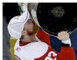
PHOTO GALLERIES Relive the magic of Wings' win Check out our dozens of photo galleries from the Detroit Red Wings Stanley Cup championship season.

PANORAMIC VIEW 360 degrees of Obama rally Check out this freep.com exclusive -- a panoramic view of Sen. Barack Obama's rally at the Joe Louis Arena.