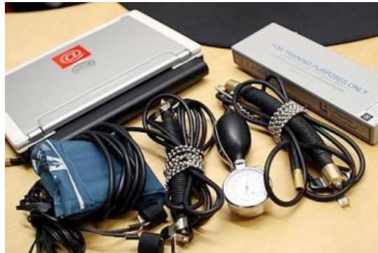
The various parts of a lie detector. The polygraph was invented in 1921 by a medical student named John Larson.

“There was this woman who suspected her daughter had been lying to her. The mother would fetch her to work every morning, only to have her change into different clothes so she could have a good time with her friends.