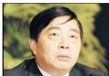
记录仇和副省长轨迹