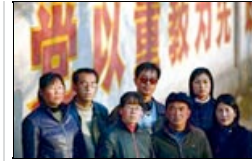
44.8万代课教师被清退调查

关键词： Mr Triadvocates please visit http Michigan WASHINGTON