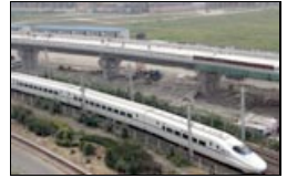
新双城记：京津赛跑