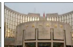
央行07年第6次调利率