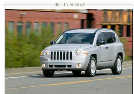
2008 Jeep Compass (Jeep/Chrysler)

Among them: An entry-level Dodge Grand Caravan with the popular Stow 'n Go seating formerly standard on more well-appointed models of the minivan.