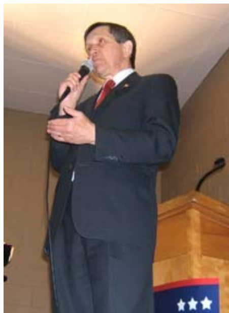
Rep. Dennis Kucinich speaks at the University of Detroit.