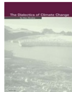
download: The Dialectics of Climate Change