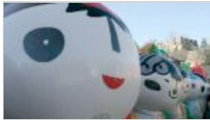
Blog: Countdown to the 2008 Olympics in Beijing