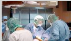
France best, U.S. worst in preventable death ranking