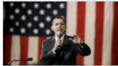
Some Kenyans forget crisis to root for Obama