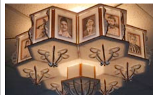
PCMC has put up a lantern with the paintings of freedom fighters on it at Ramkrishna More auditorium. The day in pictures | Nov 6 in pics