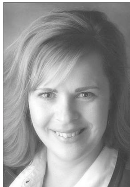
⊕ Zoom Photo