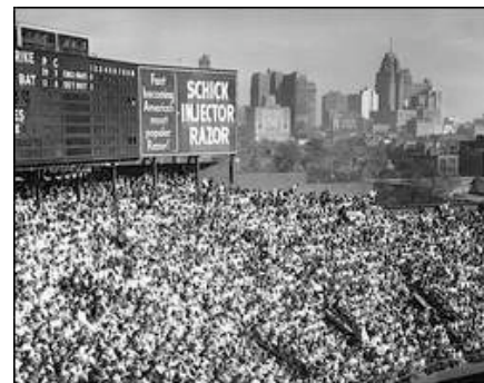
The Detroit News

Tiger Stadium, shown in Oct. 6, 1940, has been a place of unity for Detroiters, a place where they could put aside their differences and share a game of baseball. See full image