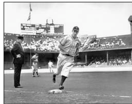
Tigers' Hank Greenberg rounds third base after hitting his 43rd home run of the season on Sept. 26, 1946. See full image