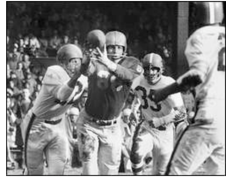
The Detroit Lions also called the stadium home from 1938 through 1974. See full image