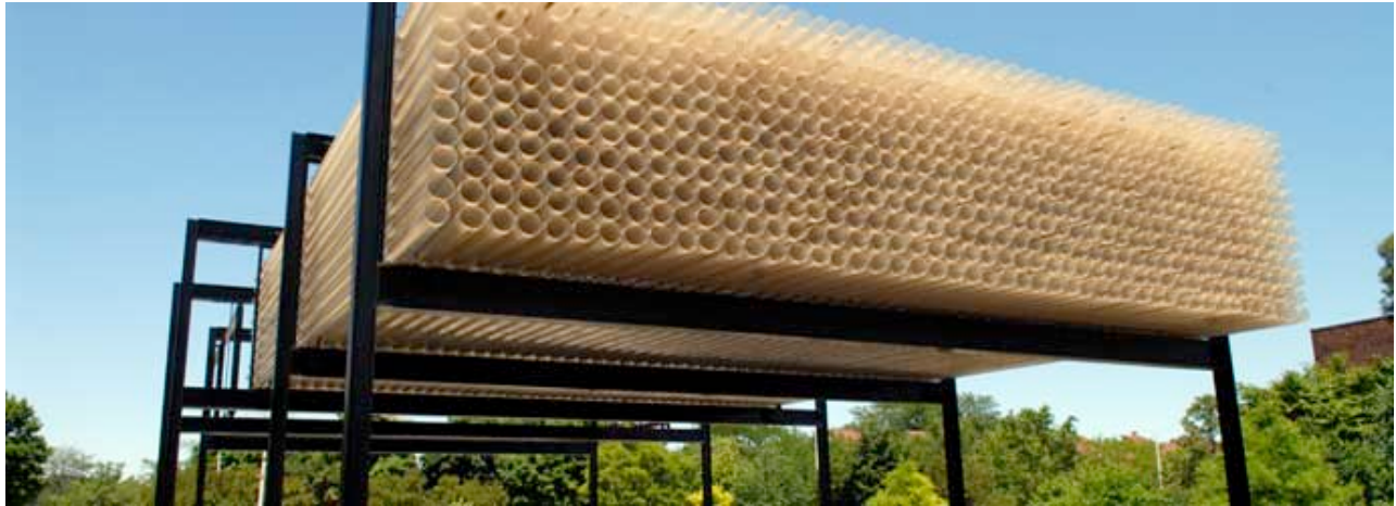
Greening of Detroit Park on East Jefferson

Home | Neighborhoods | Features | Development News | Innovation & Job News | In the News | Photo Essays | Sign Up