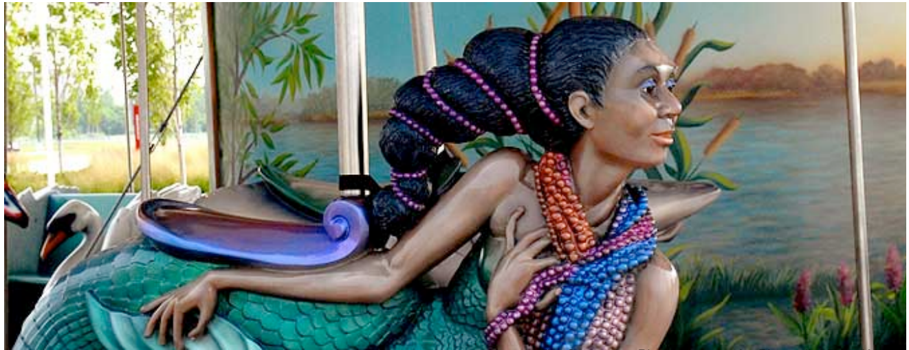
The Carousel at Rivard Plaza on the Riverwalk

Home | Neighborhoods | Features | Development News | Innovation & Job News | In the News | Photo Essays | Sign Up