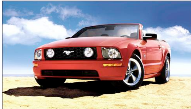
The Ford Mustang is among four of the automaker's domestic vehicles -- the Mercury Milan, Lincoln MKZ and Lincoln Mark LT are the others -- that finished atop its segment in the annual Initial Quality Study.