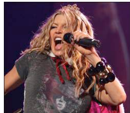
Fergie performs last month in Uniondale, N.Y. See full image