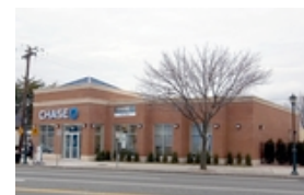
Chase branch in Williston Park, NY