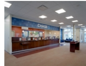
Chase branch in Williston Park, NY, interior