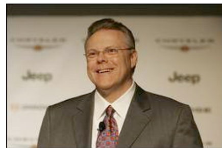
LaSorda See full image