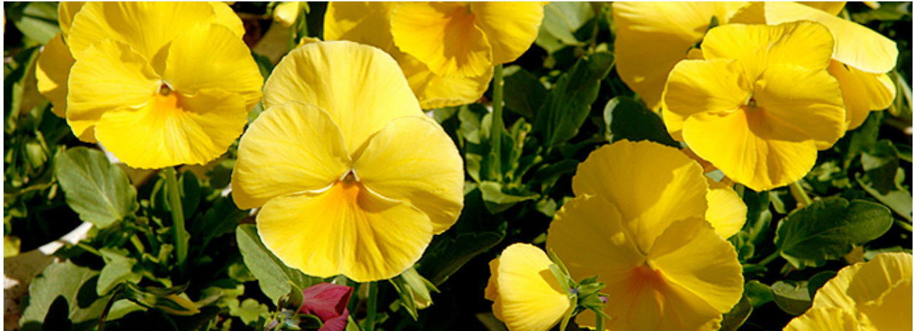
Flower Day in Eastern Market | Dave Krieger

Home | Neighborhoods | Features | Development News | In the News | Photo Essays | Sign Up