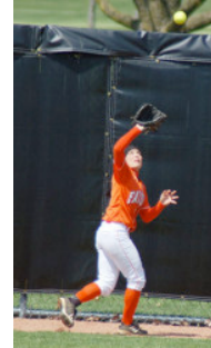
The Falcons rank in the national Top 15 for their .793 W-L percentage.

Live stats via GAMETRACKER will not be available this weekend ... fans can follow the Falcons on Friday by clicking HERE for live stats powered by SIDEARM ... for games at Central, fans can listen LIVE to Saturday and Sunday's call.