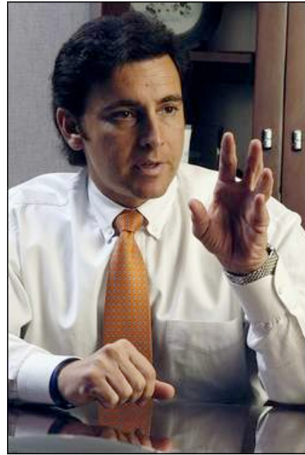
Ford's Mark Fields asks workers to use "a more confident tone." See full image