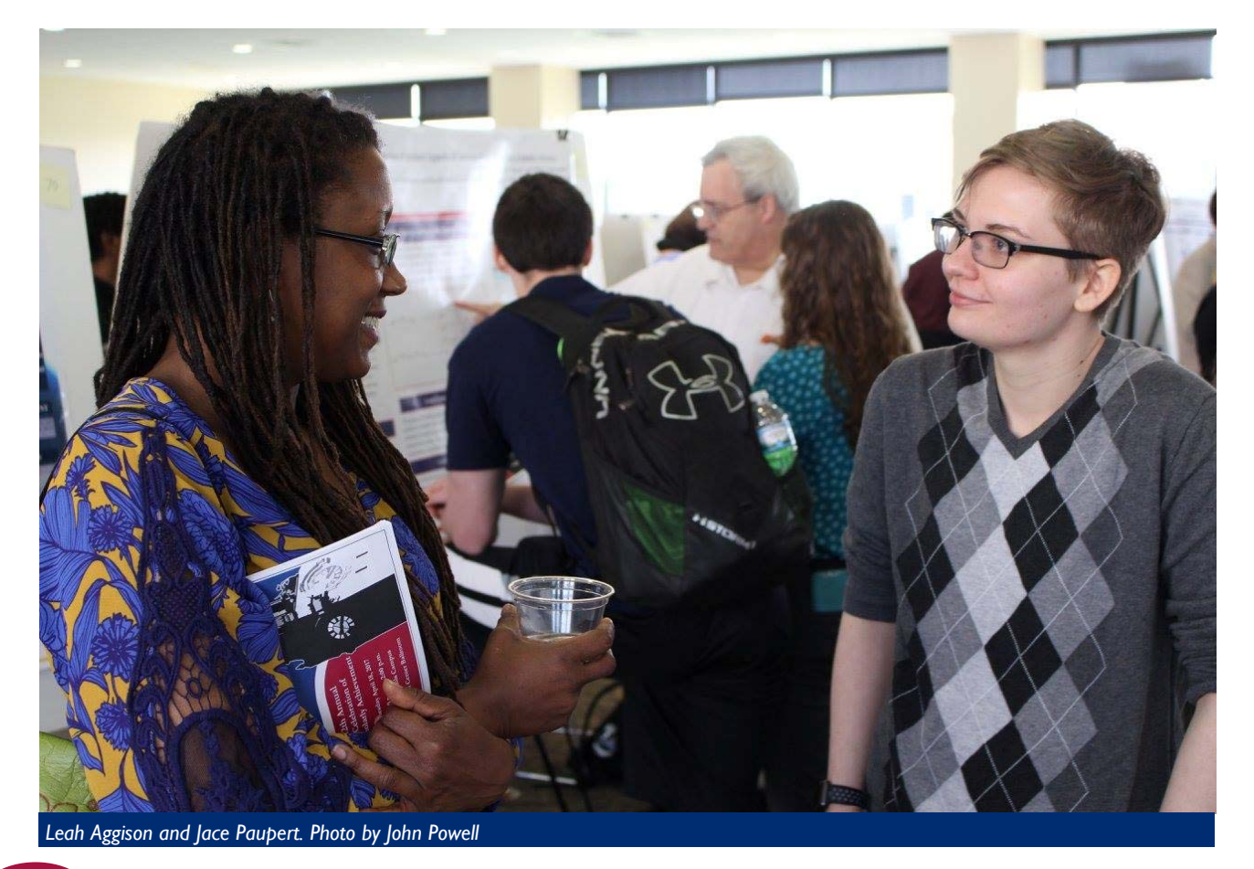
DETROIT MERCY RESEARCH & GRANTS

For more details and event photos, please see the website: <u>http://research.udmercy.edu/find/</u> <u>special_collections/digital/csa/.</u>