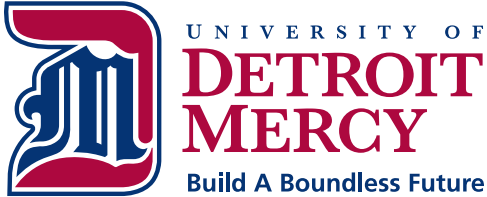
Pantone 1945 + Pantone 288 File name: LOGO_DM_BL_ST_SC