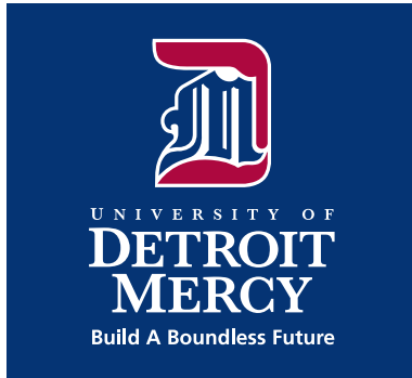
4-Color + White File name: LOGO_DM_BL_V_4C_WHT