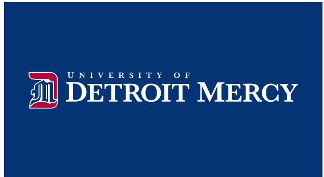
Pantone 1945 + Pantone 288 + White File name: LOGO_DM_H_SC_WHT