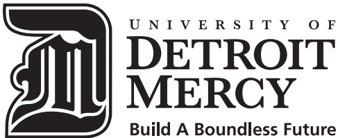
Black File name: LOGO_DM_BL_ST_BLK