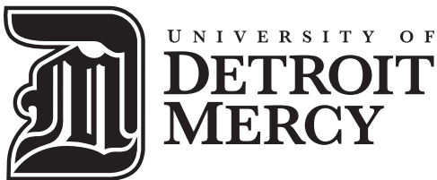
Black File name: LOGO_DM_ST_BLK