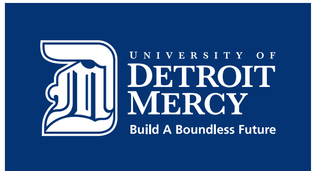
White File name: LOGO_DM_BL_ST_WHT

eps, jpg and png files are provided for all items. Files will work in both Macintosh and Windows platforms.