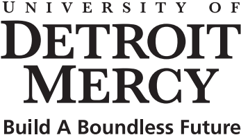
Black File name: DM_BL_ST_C_BLK