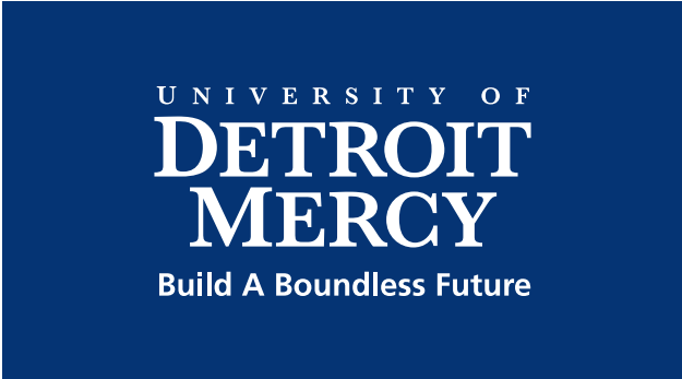
White File name: DM_BL_ST_C_WHT

eps, jpg and png files are provided for all items. Files will work in both Macintosh and Windows platforms. eps Use for quality reproduction, scalable vector art created in Adobe® Illustrator. jpg, png Use in Microsoft® Office Suite and digital applications. JPG AND PNG FILES SHOULD BE SCALED AT 100% OR LESS. NEVER ENLARGE A JPG OR PNG FILE.