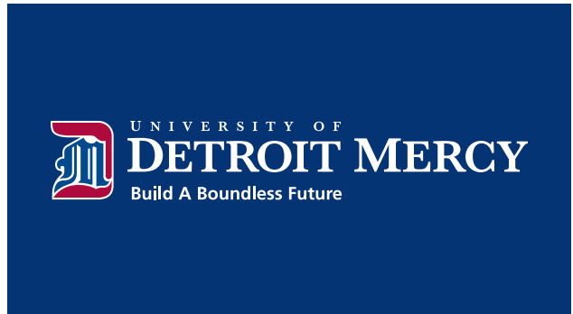
Pantone 1945 + Pantone 288 + White File name: LOGO_DM_BL_H_SC_WHT