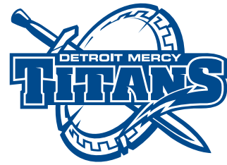
Pantone 288 + White File name: DM_TITANS_288