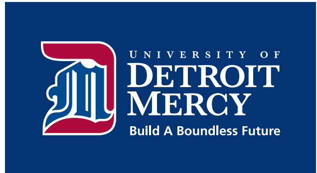
Pantone 1945 + Pantone 288 + White File name: LOGO_DM_BL_ST_SC_WHT