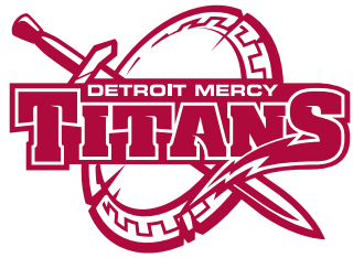
Pantone 1945 + White File name: DM_TITANS_1945