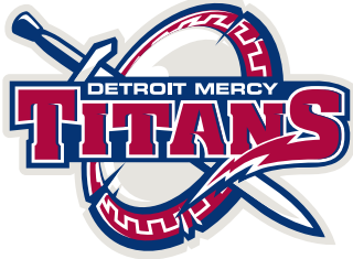
Pantone 1945 + Pantone 288 + PMS WGRAY 1 + White File name: DM_TITANS_SC