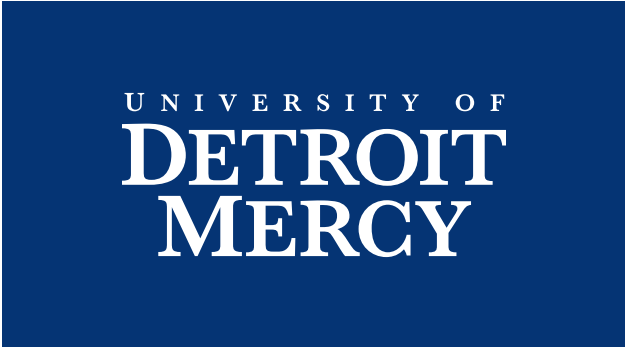
White File name: DM_ST_C_WHT

eps, jpg and png files are provided for all items. Files will work in both Macintosh and Windows platforms. eps Use for quality reproduction, scalable vector art created in Adobe® Illustrator. jpg, png Use in Microsoft® Office Suite and digital applications. JPG AND PNG FILES SHOULD BE SCALED AT 100% OR LESS. NEVER ENLARGE A JPG OR PNG FILE.