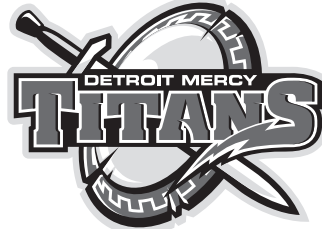
Greyscale File name: DM_TITANS_GS

eps, jpg and png files are provided for all items. Files will work in both Macintosh and Windows platforms. eps Use for quality reproduction, scalable vector art created in Adobe® Illustrator. jpg, png Use in Microsoft® Office Suite and digital applications. JPG AND PNG FILES SHOULD BE SCALED AT 100% OR LESS. NEVER ENLARGE A JPG OR PNG FILE.